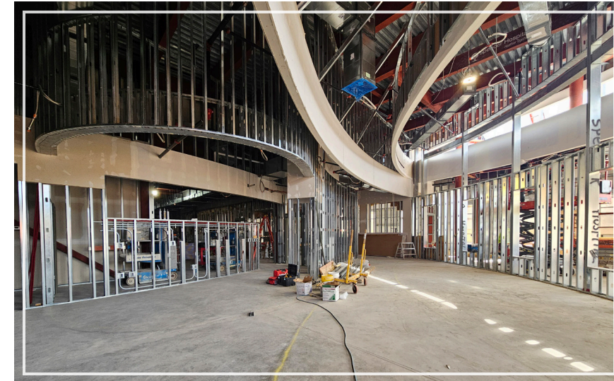
Pictured Above: ED Entrance and Waiting Room Area

CONSTRUCTION ON THE NEW EMERGENCY DEPARTMENT AT SPENCER HOSPITAL IS MOVING FORWARD STEADILY, WITH SIGNIFICANT DEVELOPMENTS IN RECENT MONTHS. AS WINTER APPROACHES, THE CONSTRUCTION TEAM HAS MADE REMARKABLE PROGRESS, AND THE BUILDING IS NOW NEARLY FULLY ENCLOSED. THIS MILESTONE ALLOWS FOR UNINTERRUPTED INTERIOR WORK, KEEPING THE PROJECT ON TRACK.