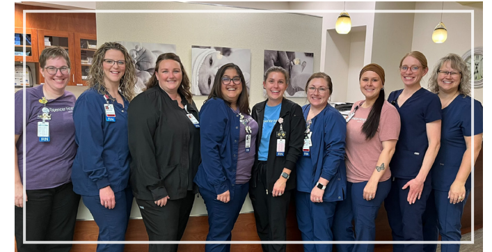
Spencer Hospital Birth Center Nursing Staff